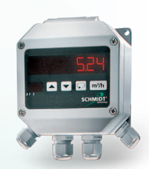
LED display in wall housing