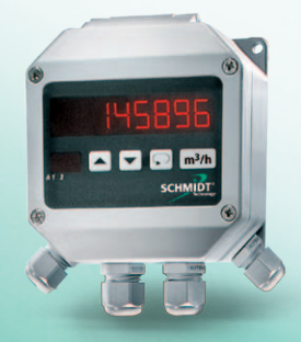
LED display MD 10.010/015 in wall housing